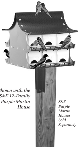
Shown with the S&K 12-Family Purple Martin House

S&K Purple Martin Houses Sold Separately